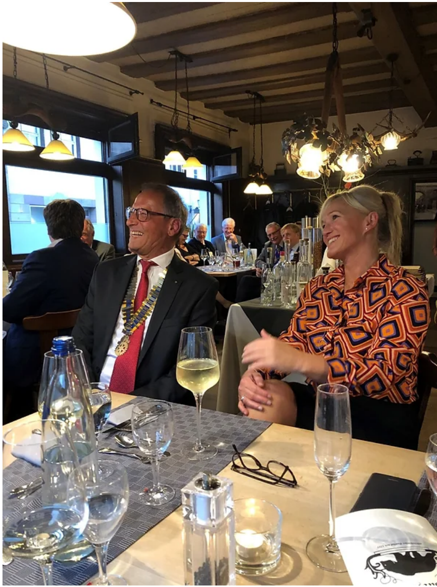
Saturday May 28th